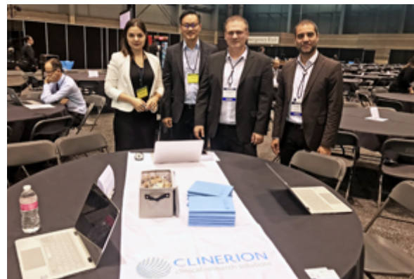
The Clinerion team at the 2018 ASCO Annual Meeting, Chicago, IL, June, 2018.